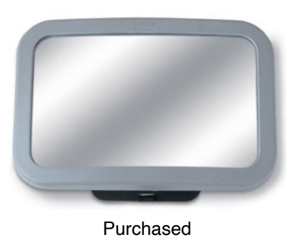
Britax Backseat Mirror