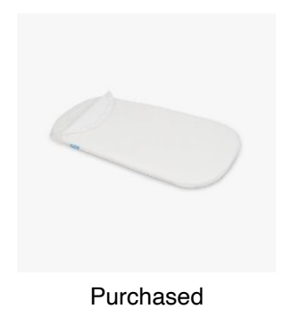
Uppababy Bassinet Mattress Cover in Cream