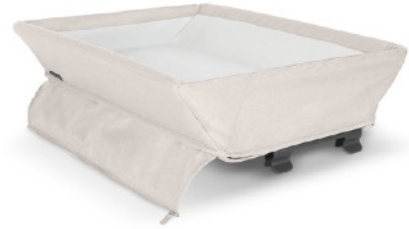
Uppababy Charlie Remi Play Yard