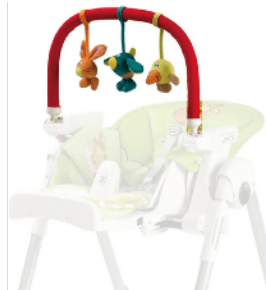
Peg Perego Siesta High Chair in Noce