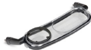
Uppababy Hamper Insert for Bassinet Stand