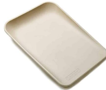
Premium Cotton Waterproof Cover for Starlight Mattresses