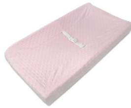
Waterproof Contour Changing Pad