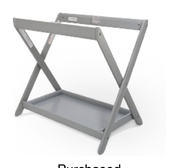
Purchased Uppababy Bassinet Stand in Grey